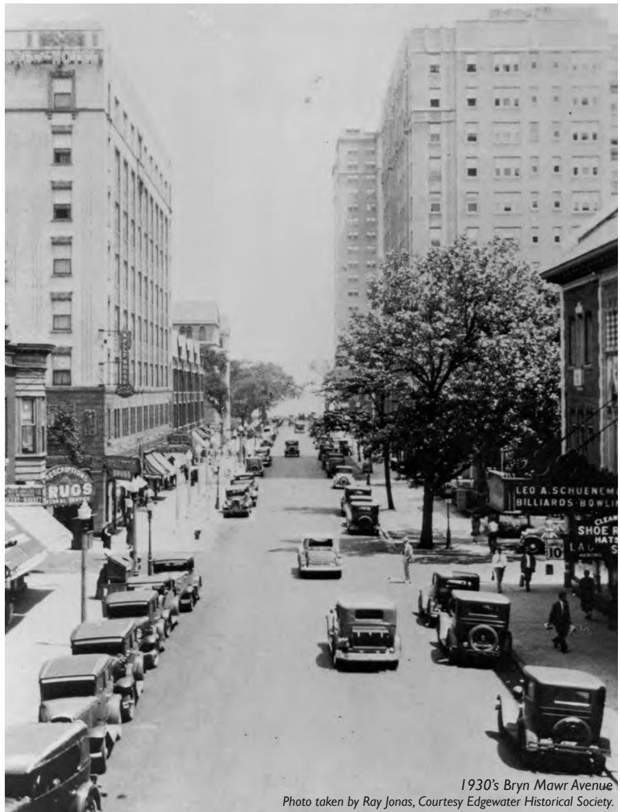
1930's Bryn Mawr Avenue

Edgewater residents continue to enjoy modern urban living in a well designed community situated on Chicago's north side.